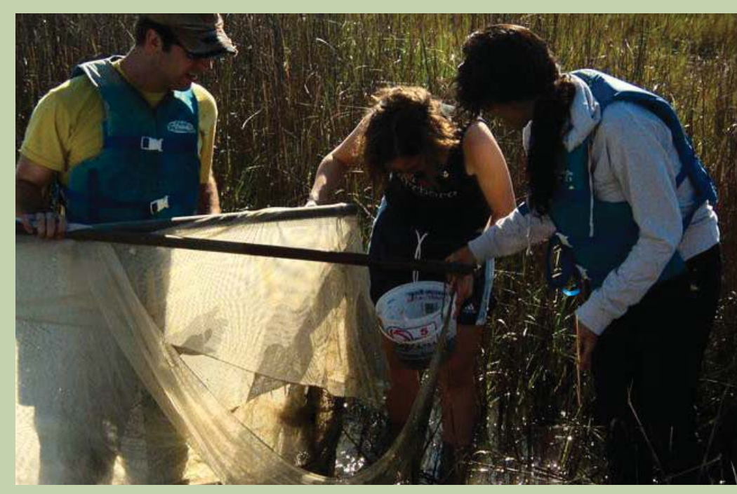
Seining critters at Louisiana Marine Consortium, Cocodrie, for Coastal Law class, Spring 2013.