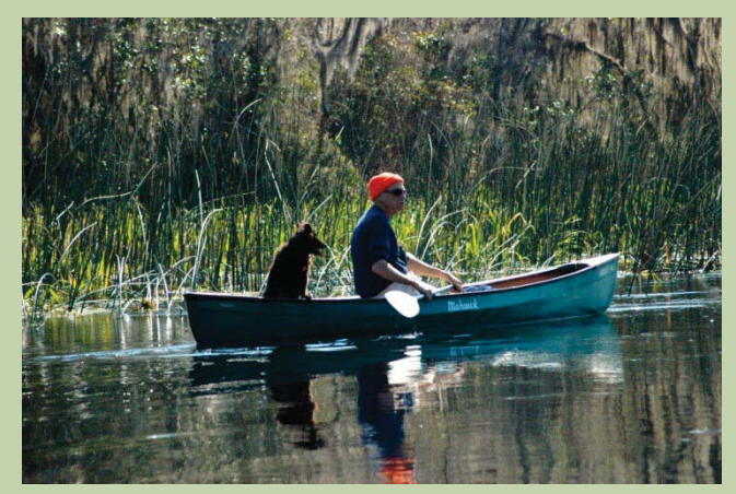
Faithful TEELS mascot Ms. Bear and paddler, Fall 2012.