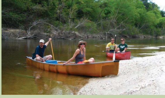
Wolf River paddle, Spring 2013