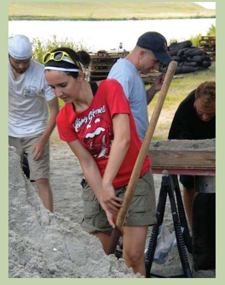
Bayou St. John wetland restoration project